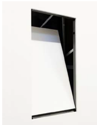
Effective ventilation when open.