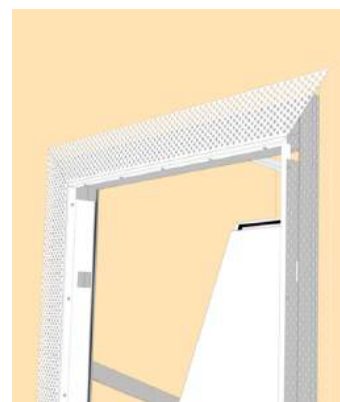
Skimmed finish and damper panel can then both be painted to match.