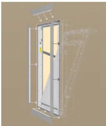
A bead edge profile is fixed to align with the opening edge to allow a plaster finish to be skimmed up to the opening.