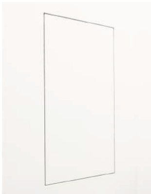
Unobtrusive when closed.